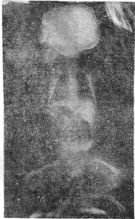
Fig. 2 X-ray of the baby showing an opacity reminiscent of a long bone, in the upper part of the mass.

of the mouth and complete excision was impossible. The immediate post-operative clinical course was unremarkable.