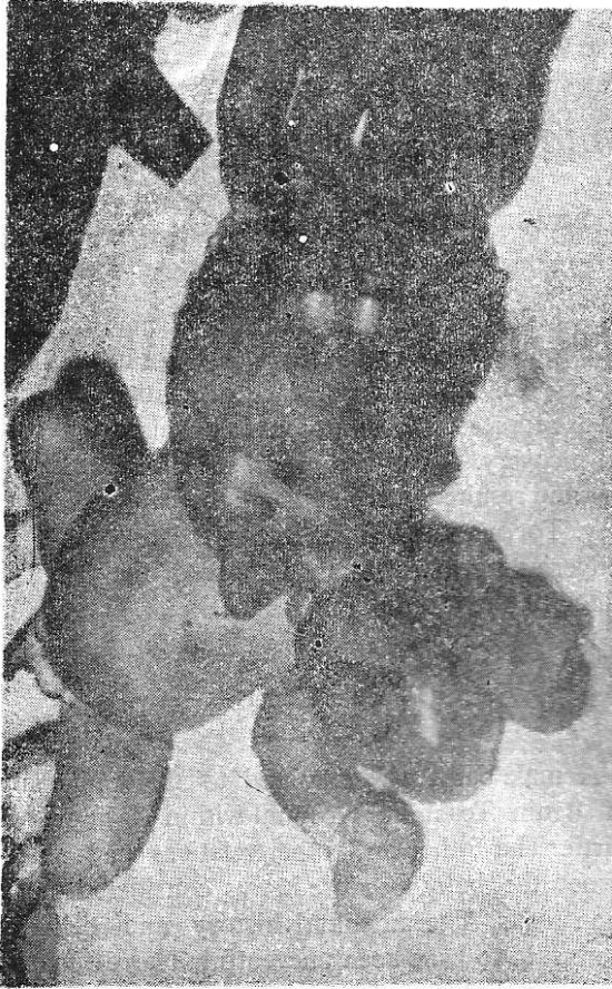
Fig. 1 Baby with mass attached to the left lateral edge of the tongue and floor of mouth.