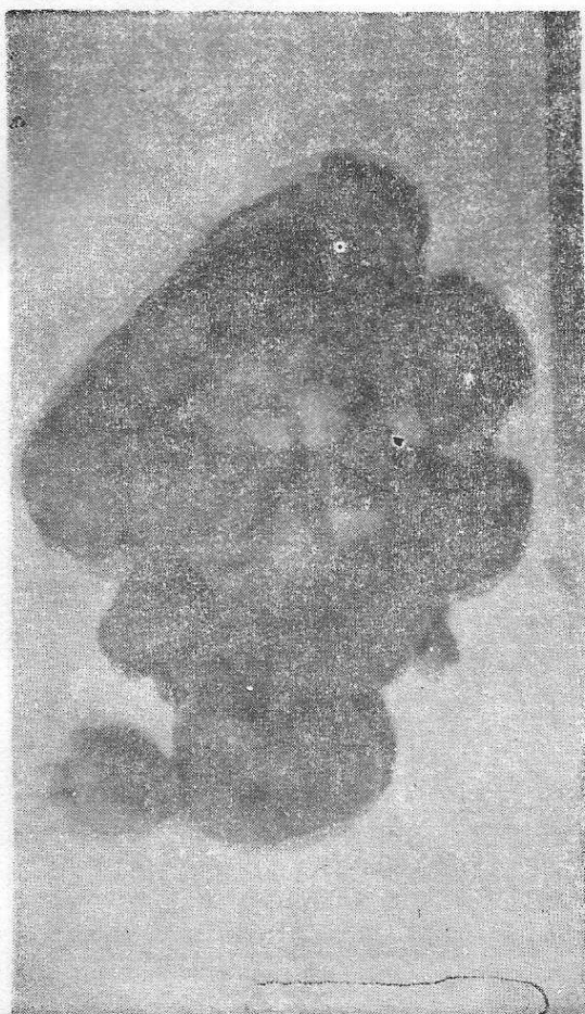
Fig. 3 The mass after it had been removed. Note the rudimentary limb and the nipple like structures.

In other areas, salivary glands and fibro-fatty tissues were detected. Well developed intestinal mucosa (Fig 6) and smooth muscles were present and well-formed skin with its appendages was found in the nipple-like structure; mammary glands were however, absent.