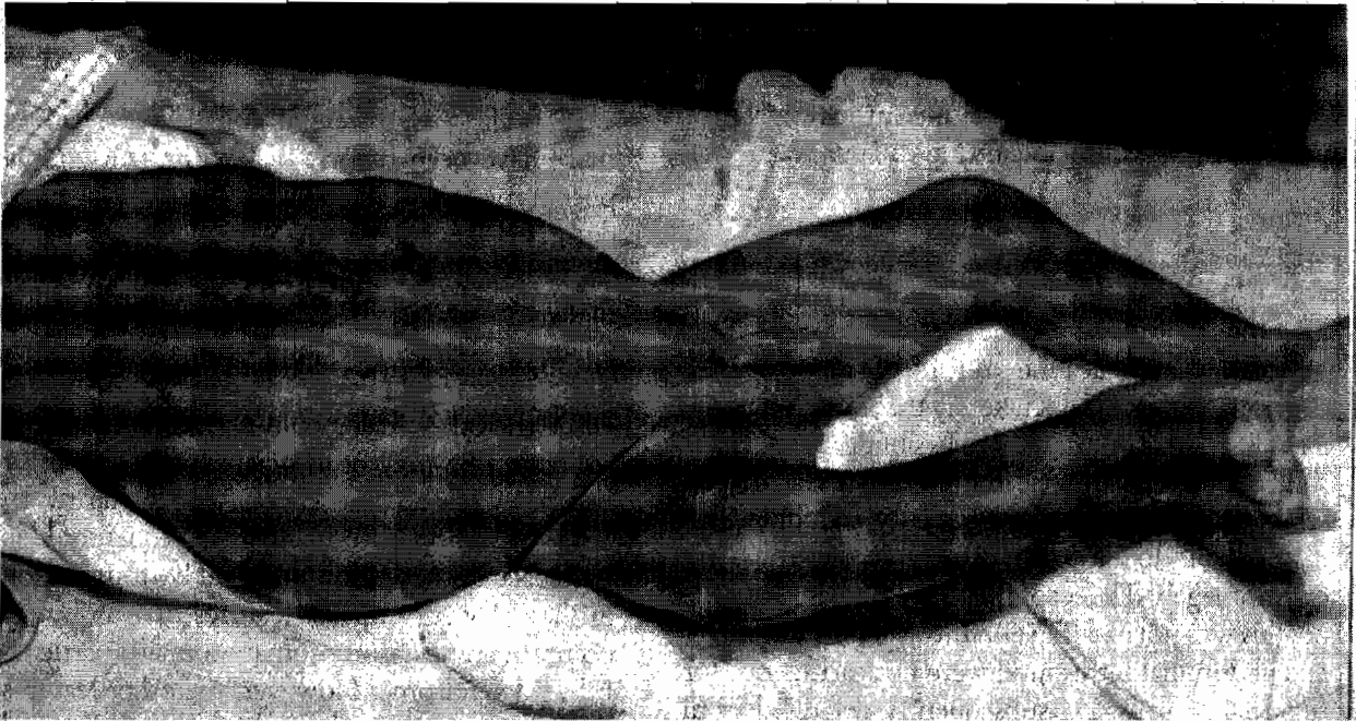
Fig. 1: Photograph of Case 1, showing pendulous and wrinkled abdomen with visible and dilated loops of bowel