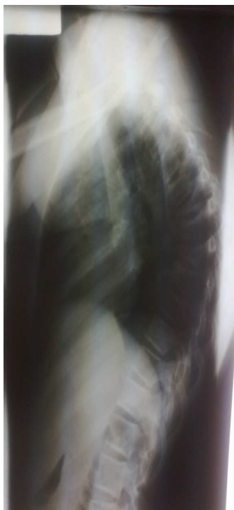
Fig 1 Radiograph of the thoracic vertebrae showing wedge collapse affecting T3 to T6

The initial diagnosis was tetanus co-existing with tuberculosis of the spine to exclude multiple vertebral fractures complicating the tetanus. Her full blood count showed a total white cell count of 11.5 \times 10^9 / l ; neutrophils- 80% and lymphocytes- 20%; packed cell volume - 33% and Erythrocyte sedimentation rate- 23mm/hour (Western Green Method). Mantoux test and retroviral screening were negative. The urinalysis and electrolyte, urea and creatinine assays were normal. X-rays of the cervical spine were normal except for the straightening of the vertebrae. Thoracic spine radiographs showed kyphoscoliosis, anterior wedge collapses of T3-T6 vertebral bodies with reduction of their intervening disc spaces (Fig. 1). The other vertebrae, paraspinal soft tissues and chest were normal on X-rays and did not suggest tuberculosis.