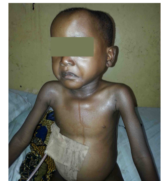
Fig1: Showing head and anterior chest wall swellings

A 4- year- old male Nigerian was seen at the Nnamdi Azikiwe University Teaching Hospital, Nnewi, with a 14- week history of recurrent fever, multiple facial swellings with enlargement of the head and protrusion of the eyes, (fig. 1). There was also a history of significant weight loss and nasal discharge that occasionally was blood tinged.