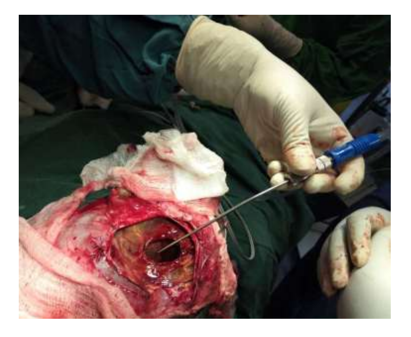
Figure 6: Gross intraoperative image taken during craniotomy.

Histological studies also reported the presence of fibrin dots with red blood cells, consistent with the reports of other reviewers.<sup>1-8</sup>