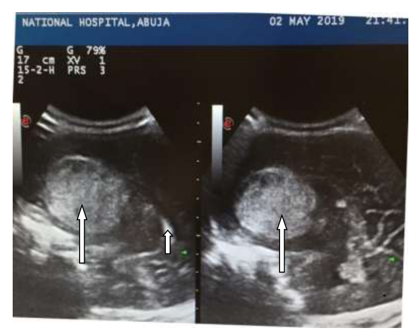
Figure 1: A fairly oval heterogenous but predominantly hyperechoic mass with a hyperechoic capsule was noted within the frontal lobe (long white arrows) with associated compression of the adjacent lateral ventricle and mild intraventricular haemorrhage (short white arrow).

in Figure 6. The surgical findings included 20-30 mls of altered blood within the encapsulated brownish mass at the frontal lobe with extension into the ipsilateral lateral ventricles, as shown in Figure 7. The specimen was sent for histopathological analysis with 10% neutral buffered formalin. The histology report revealed fibrin clots with red blood cells only. There was no histopathologic evidence of vascular malformation. The final diagnosis of encapsulated haematoma was established. The patient made dramatic improvement postsurgery and was discharged two weeks later. He is currently on monthly follow-up and has no new complaints.